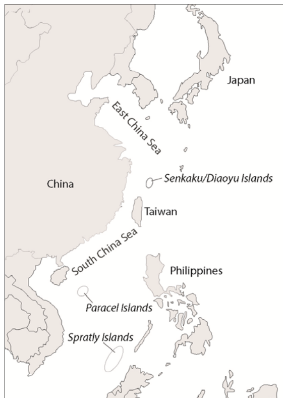
Figure 2: Map of the disputed areas in the East and South China Seas